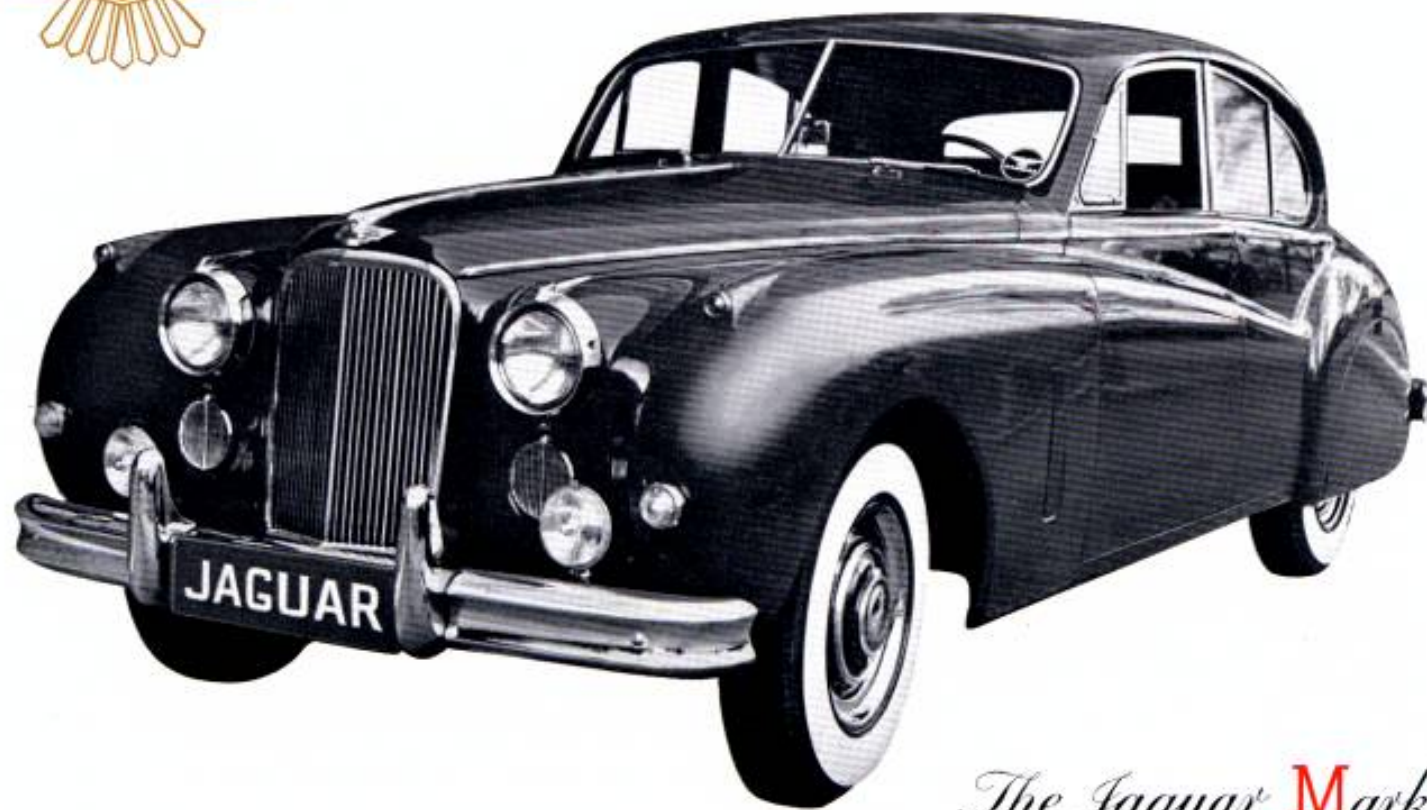
The Jaguar Mark VII sedan