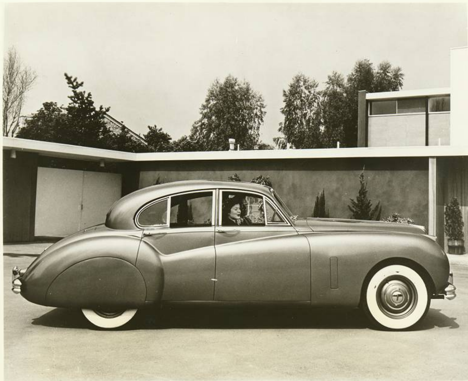
The British Jaguar Mark VII is now on display at _____. Car is powered by the famous Jaguar XK-120 twin-overhead camshaft engine and is capable of speeds in excess of 100 m.p.h. Over-all length of this five passenger sedan is 16 ft. 4 in. Interiors are handcrafted and instrument panel is highly polished walnut wood.