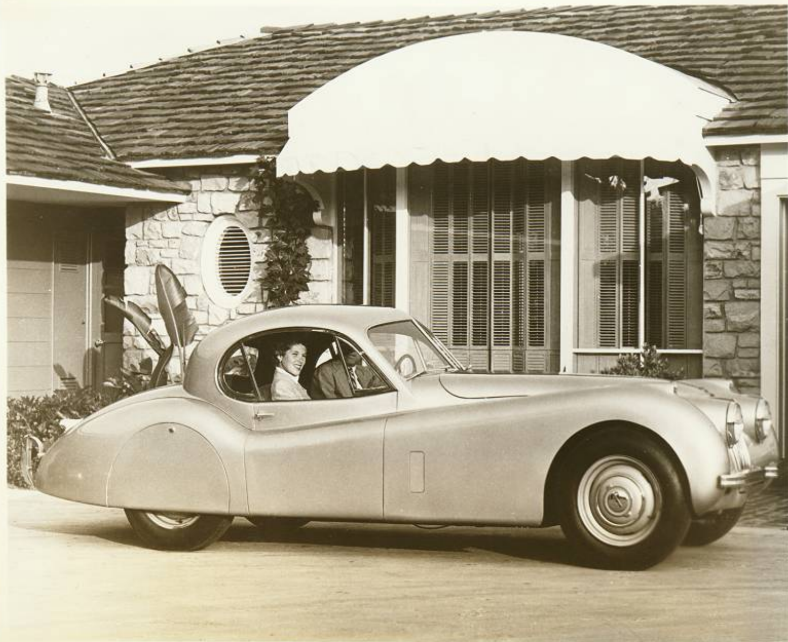
Newest model in the line of British Jaguar cars is the Sports Coupe. This hard-top version of the world's record holding XK-120 combines the performance of a sports car with the comfort and utility of a completely enclosed coupe. This car is currently on display at _____.