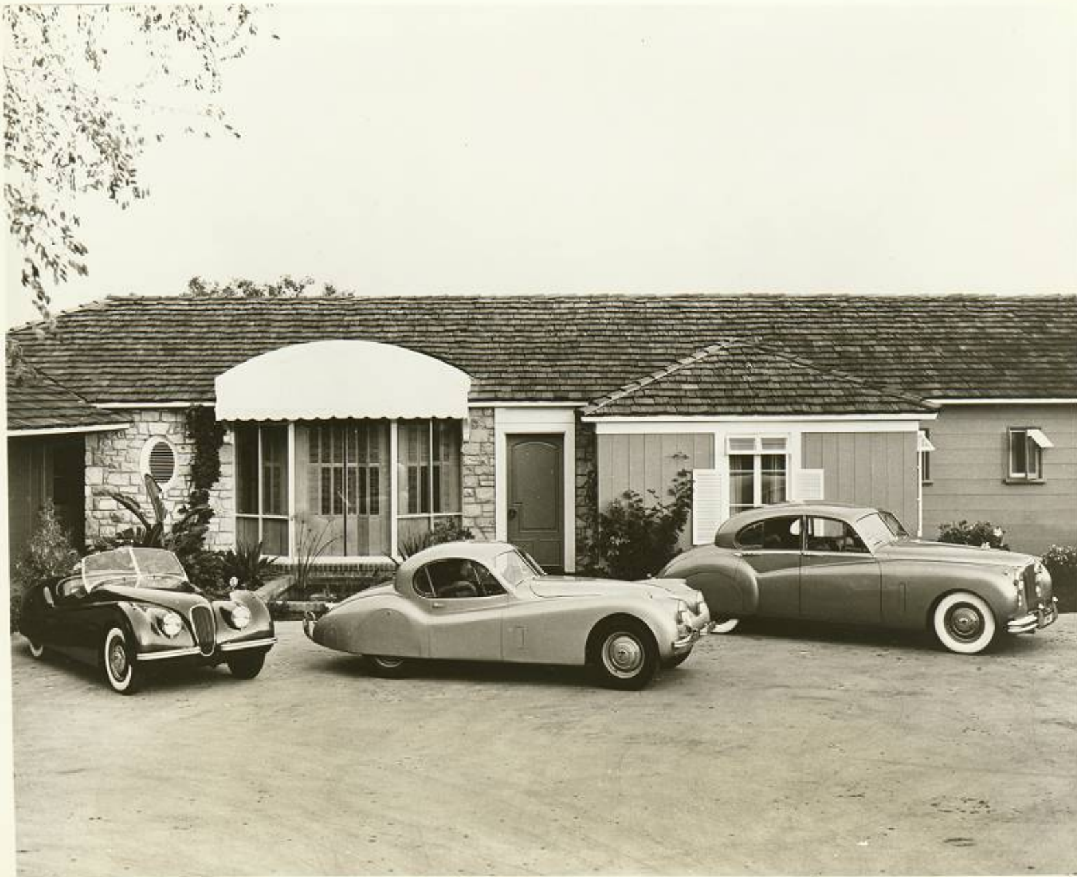
Three distinguished British Jaguar cars now on display at _____. Left, the XK-120, holder of the world's production car speed record of 132.6 m.p.h. Center, the Sports Coupe, a fully enclosed version of the XK-120. Right, the beautiful Mark VII Sedan, a five passenger car with superb, handcrafted interior appointments.