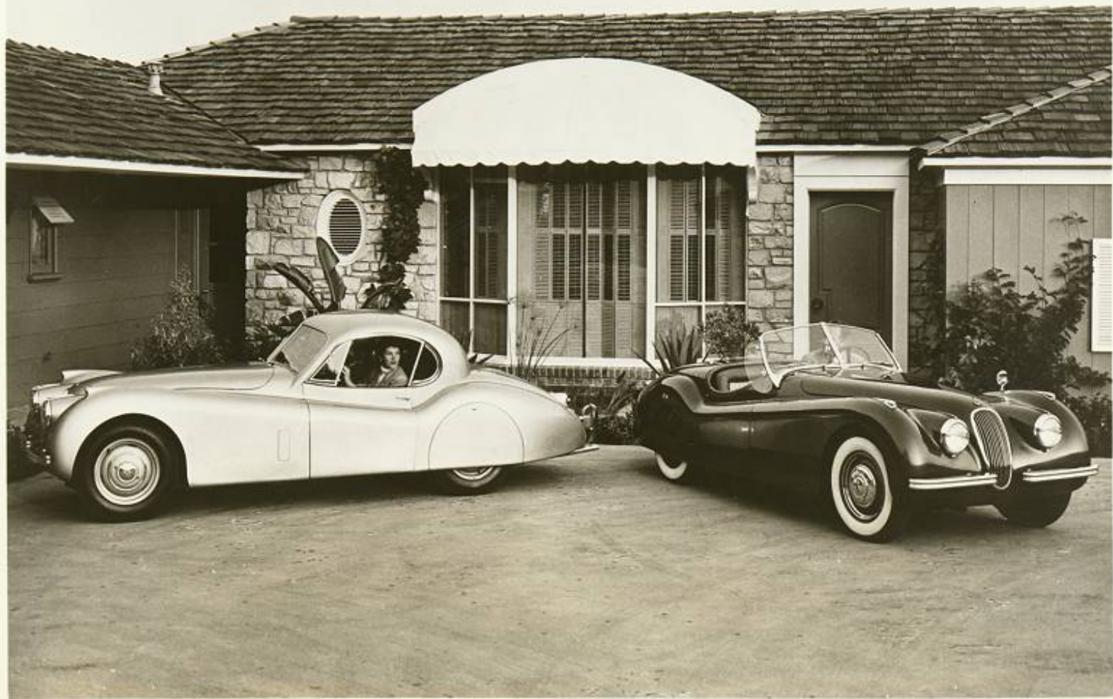
British Jaguar Sports Cars now on display at _____ are causing considerable comment. Both cars are capable of speeds in excess of 100 m.p.h. The XK-120, right, holds the world's production car speed record of 132.6 m.p.h. The Sports Coupe, left, is the newest model in the Jaguar line.