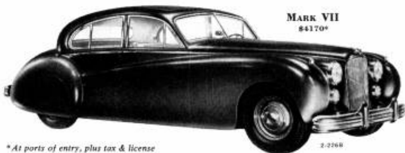
MARK VII $4170*