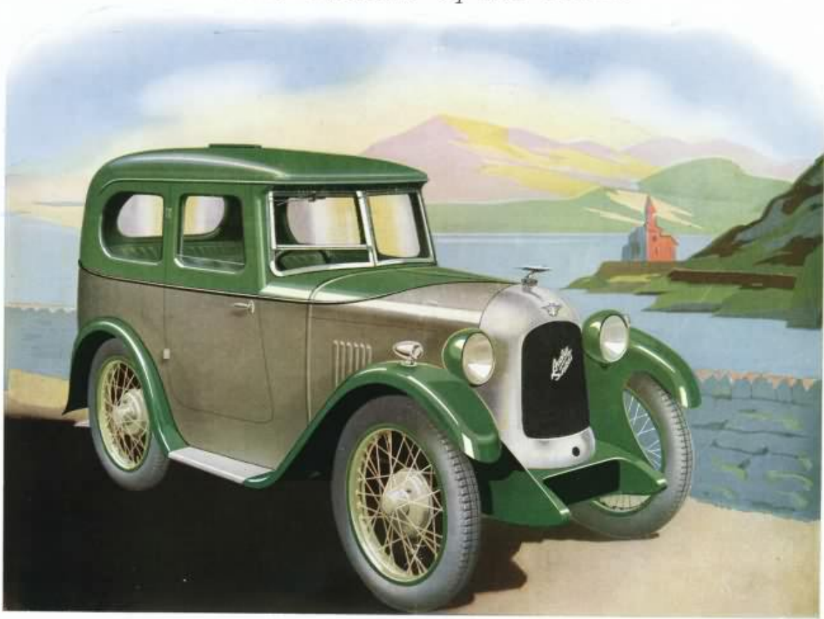
Austin-Swallow Sports Saloon