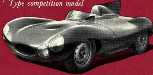
'D' Type competition model

The 'D' type is now in production as the successor to the world-famous 'C' type. With an engine developing 250 b.h.p. at 6,000 r.p.m. and equipped with disc brakes, this is the fastest sports car ever to be put into series production.