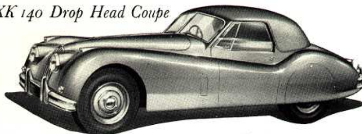
XK 140 Drop Head Coupe

The same specification as the open 2-seater but combining the advantages of open and saloon car design. With the hood up it has all the comfort of a saloon which can be converted to an open car in an instant without leaving the seat. Extra seating accommodation for two children. Also in special equipment form.