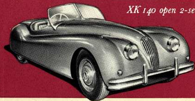
XK 140 open 2-seater

The XK.140 now offers an even higher performance together with increased leg room and greater luggage accommodation. Power output has been increased to 190 b.h.p. and rack and pinion adopted for the steering. Special equipment models have 210 b.h.p. engines, wire wheels and foglamps.