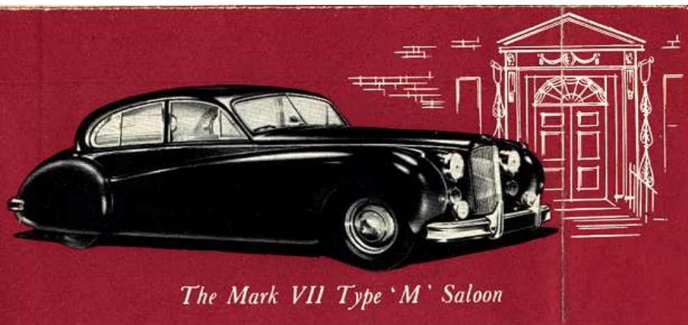
The Mark VII Type 'M' Saloon