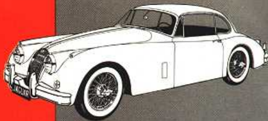
XK 150 HARDTOP COUPE

Jaguar Cars Limited reserves the right to change models and alter specifications at any time without notice.