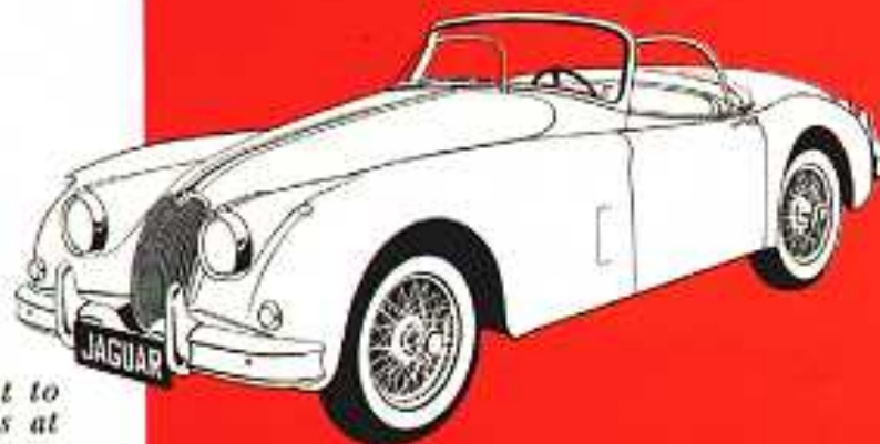
XK 150 ROADSTER