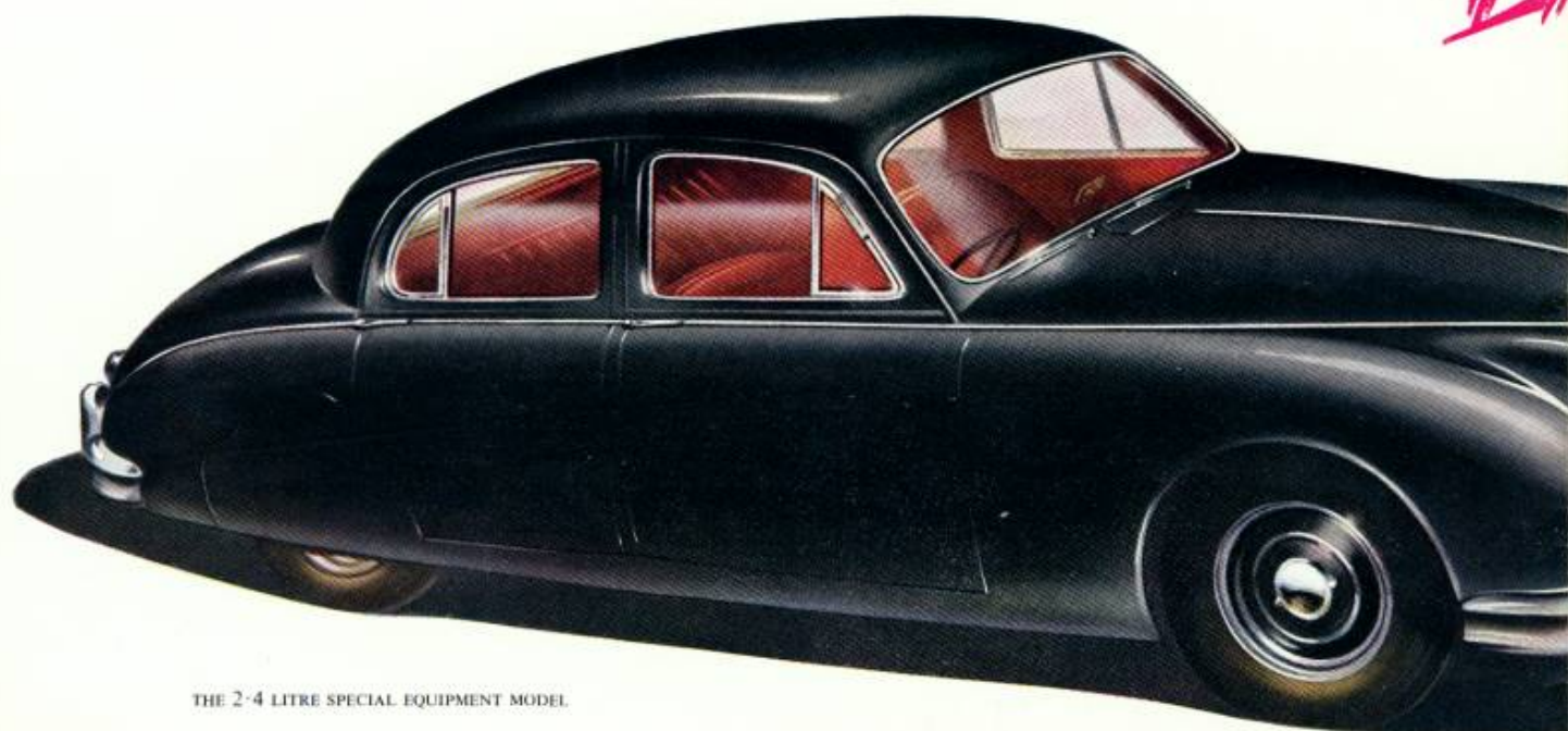
THE 2·4 LITRE SPECIAL EQUIPMENT MODEL