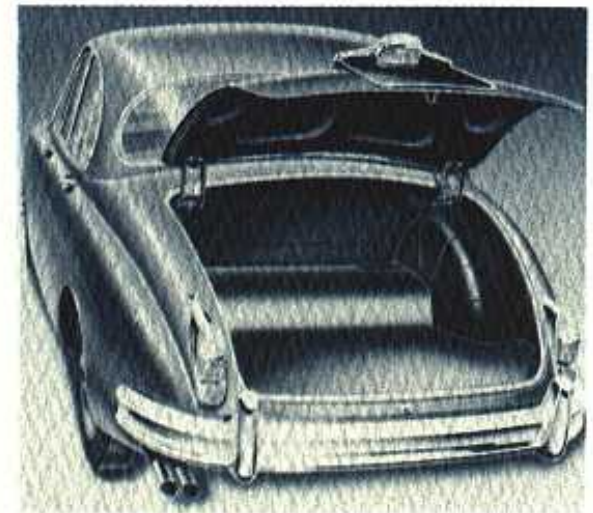
Ample luggage compartment - 12 1/2 cubic feet capacity, with automatic interior light.