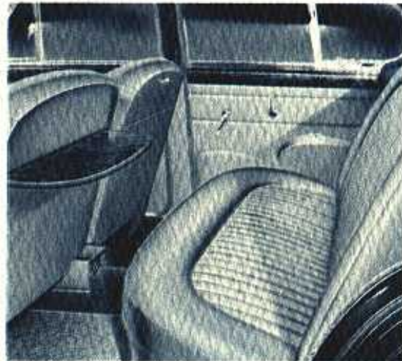
Walnut flush-fitting occasional tables; soft leather upholstery over foam rubber.