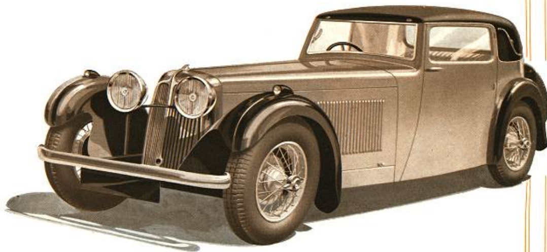
S.S.1 three-quarter view