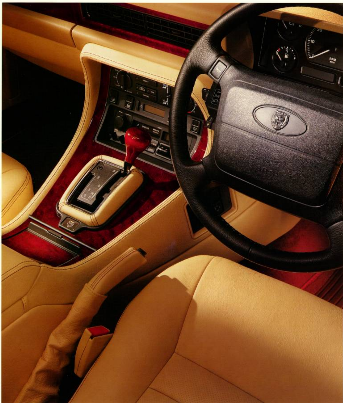
Electrically adjustable seats as shown are available as an extra-cost option.