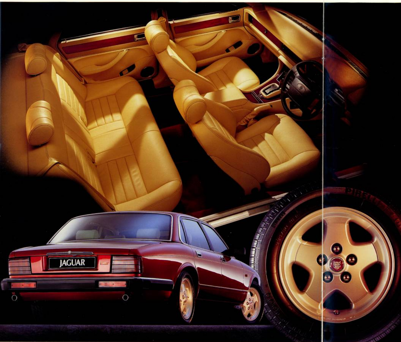
Electrically adjustable seats as shown are available as an extra-cost option.

Each and every engine and completed car is stringently tested, finishing with an exhaustive road test. The company's faith in its products is confirmed by a comprehensive 3-year, 60,000 mile (100,000 km) warranty, 6-years' anti-corrosion cover, 3 years' cover against surface corrosion, and full RAC Incident Management.