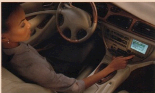
The Jaguar Integrated Navigation System uses voice responses to help lead you to your destination.

The S-TYPE interior provides such traditional Jaguar attributes as Connolly leather and bird's-eye maple trim. Yet its true luxury lies in its superb functionality. A standard 60/40 split-fold rear seat adds cargo-carrying versatility, while dual zone automatic climate control allows two individual comfort levels. The optional Jaguar Integrated