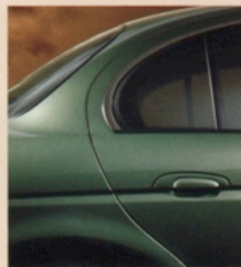
Even our world-class ten-step paint process has been upgraded.

Over the past five years, Jaguar automobiles have demonstrated tremendous advances in quality. The S-TYPE represents the important next step. Its home, Castle Bromwich, Birmingham, England, has been reengineered and retooled to house one of the world's most advanced automotive manufacturing facilities. A wealth of new production methods help deliver exacting quality, including laser gauging systems that check the tolerances