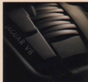
The AJ-V8 shares most of its design with the XK8 sports car engine.

technology as well. The V6 offers 2-stage variable cam phasing for smooth low-end torque, while the V8 provides even more advanced continuous variable cam phasing for optimal performance at all speeds. The S-TYPE's performance is further enhanced by its spirited ride and handling, a sensation that's delivered through a rigid body structure as well as independent double wishbone front and rear suspensions.